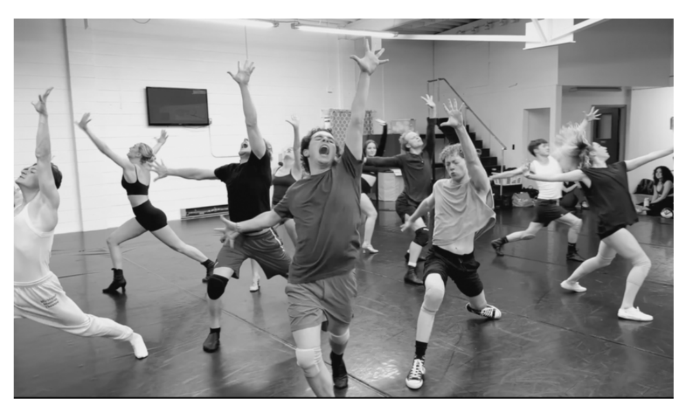
"The Jets" in rehearsal

8114 Main Street, Dexter, MI 48130 734-426-1234