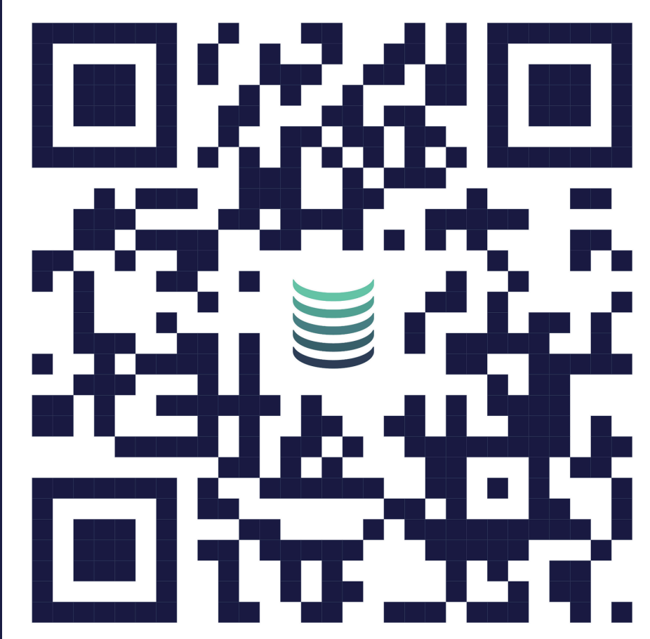
Employing the Deaf Masaka Creamery