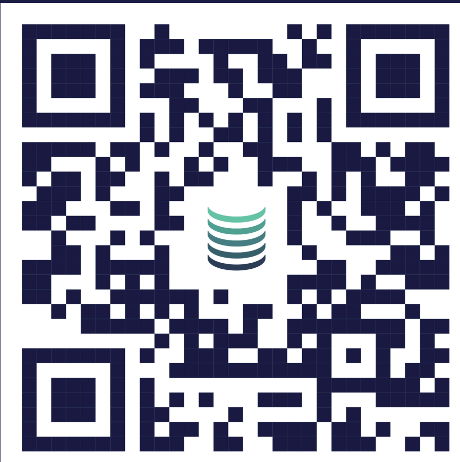
Jobs & Food Security Kivu Tilapia Farm