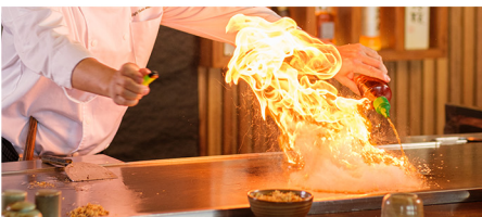
Hikari Japanese Teppanyaki