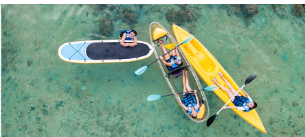
Kayak & Paddle board