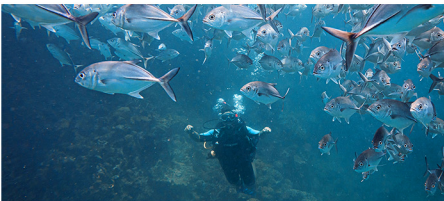
Snorkel & Diving

Escape for a day on your own private island.