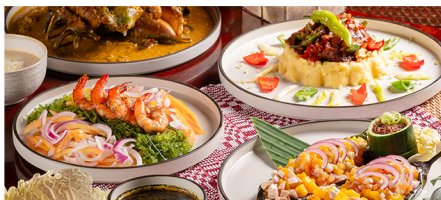
Mangrove Modern Filipino