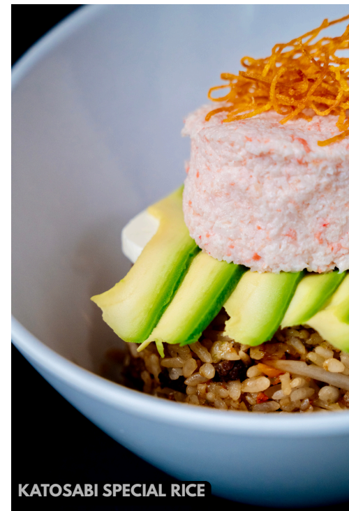
KATOSABI SPECIAL RICE

TUNA OR SALMON CUBES MARINATED WITH CHEF RECIPES AND GARNISHED WITH AVOCADO AND SEAWEED