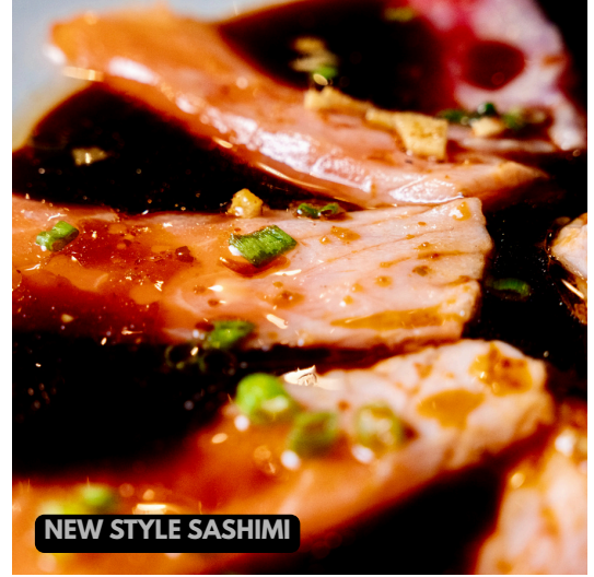
NEW STYLE SASHIMI