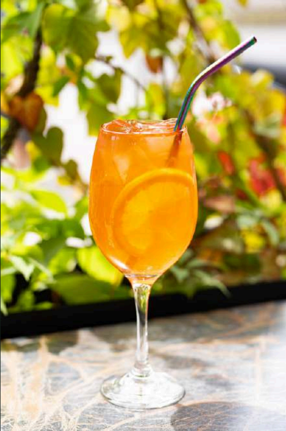
Aperol 0% 400ml 19 pln