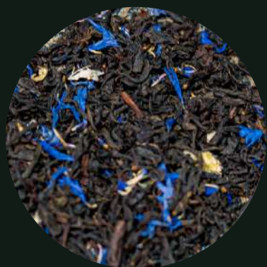
Earl grey tea