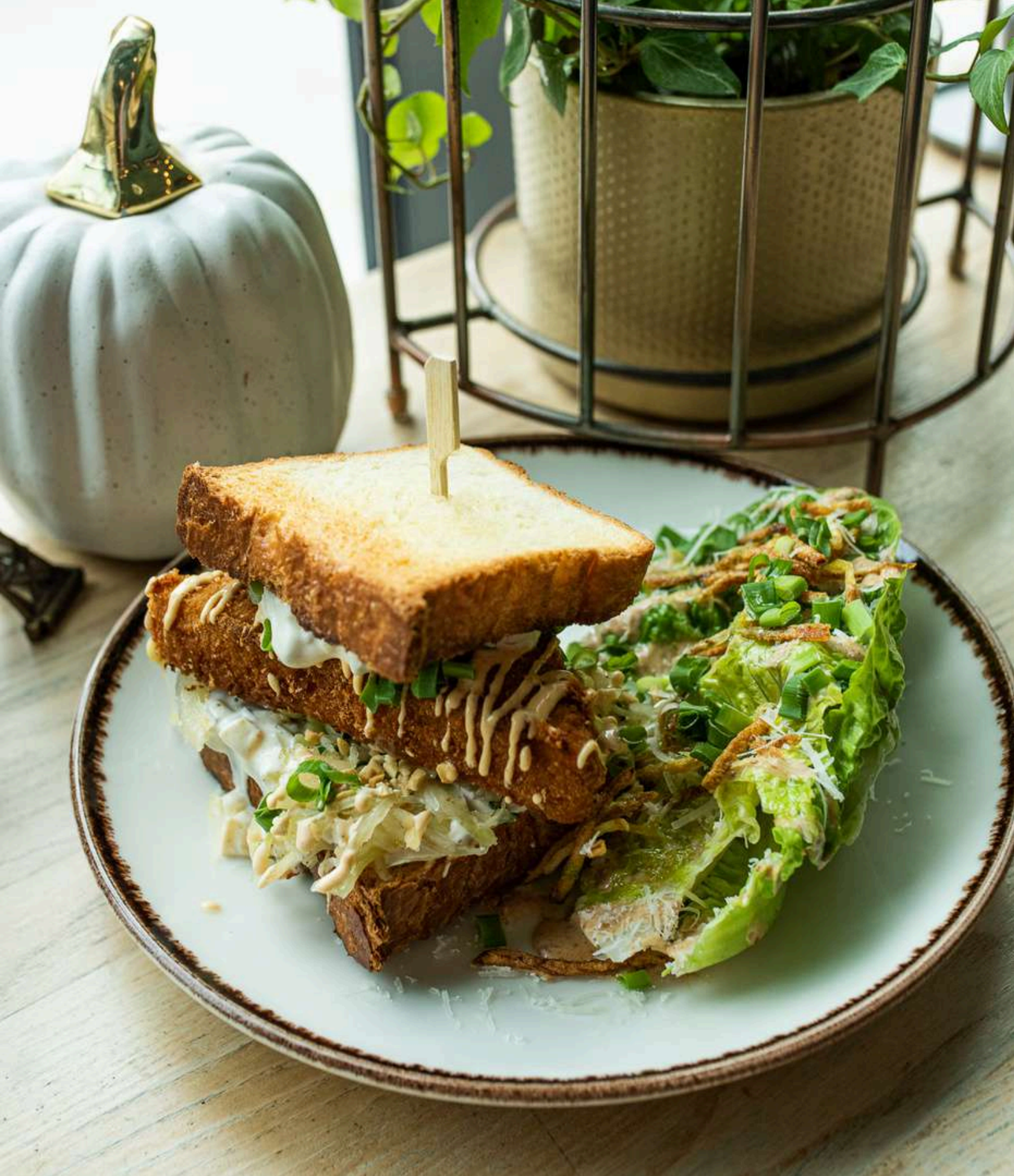
Toast with fried cheese with tartar sauce, white cabbage with parsley cream 44 PLN toast from Plon bakery / tartar sauce with chives / white cabbage with parsley and lemon / peanuts / Chilli Sriracha sauce / chives / romaine lettuce/ bacon mayonnaise / shoestring potato fries / chives / parmesan allergens: gluten, milk, eggs, nuts, mustard