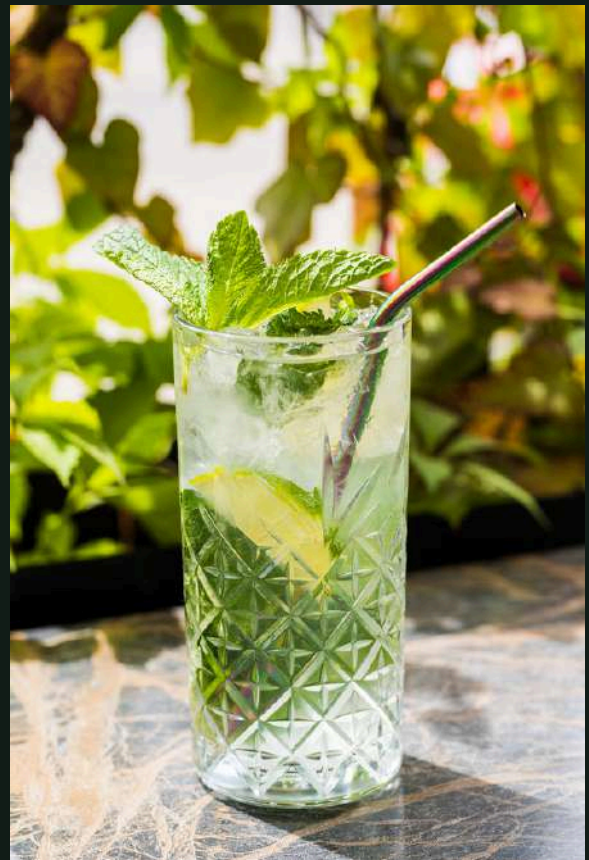
Mohito 0% 400ml 19 pln