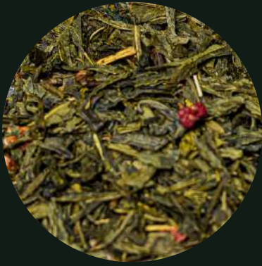
Strawberry in champagne (green tea)