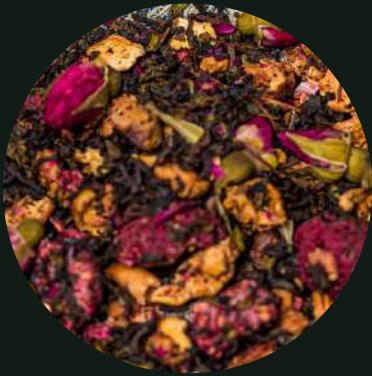
Raspberry tea (black tea)